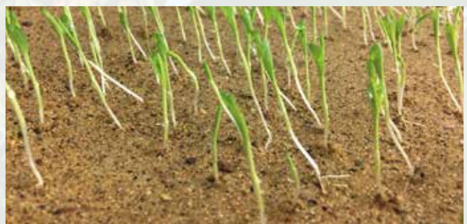
FIGURE 5. Sorghum seedlings emergence at 11 days in a Tray Cold Test