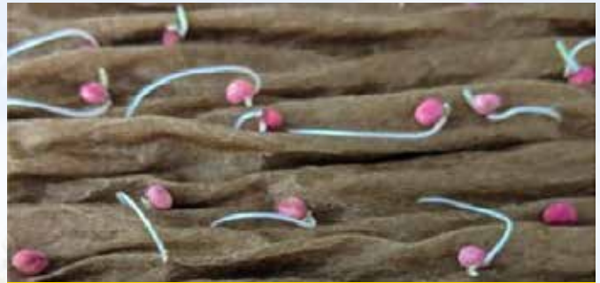
FIGURE 1. Sorghum growth at 3–4 days on paper at 20–30°C

Sorghum vigor is best evaluated using the tray cold test similar to the corn cold test with imbibition of 10°C water and testing for 7 days at 10°C followed by 4 days at 25°C (Figure 5).