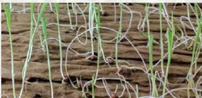
FIGURE 4. Sorghum growth after 7 days at 20–30°C