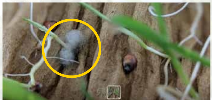
FIGURE 3. Sorghum seed colonized with gray fungus, likely Alternaria mycelium ( Alternaria spp.)