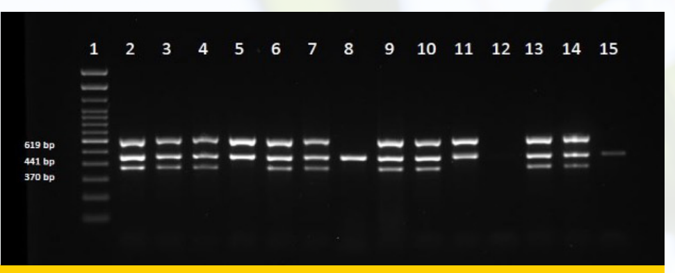
FIGURE 5. Xcc is a plant pathogenic bacterium that poses a threat to a wide range of crops, including broccoli, cauliflower, cabbage and rice. SoDak Labs uses a combination of agar isolate (left) and PCR (right) for its detection. Method NSHS Br 1.1, ISTA 7-019a.