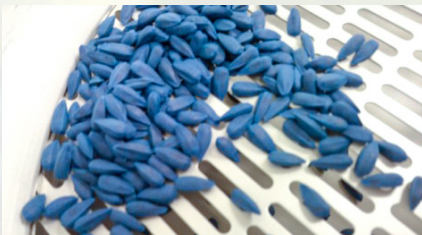
FIGURE 1. Sunflower seeds being screened for broken seeds and inert matter.

Tetrazolium is a quick estimate of germination and can be useful in determining viability of hard seeds.