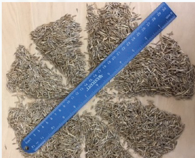
FIGURE 5. Pie halving method for chaffy species.

samplers or achievement of ISTA authorized seed sampler. Upon completion of the online course, written exam and on-site practical exam attendees are eligible to draw samples for ISTA Orange certificate testing. This course allows staff to attend the majority of the training at their facility greatly reducing the travel time and expenses for training.