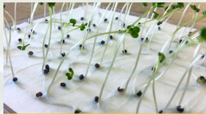
FIGURE 2. White blotter germination test on canola, seedling growth represents seven days at 20°C.