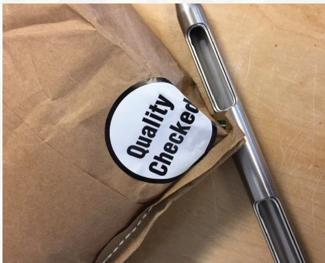
FIGURE 6. Double tube probe for many small seeded vegetables.