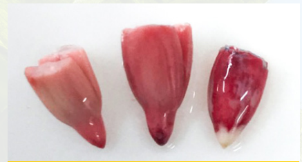
FIGURE 3. Topographical Tetrazolium staining of sunflower embryos, red tissue normally viable, white tissue non viable.